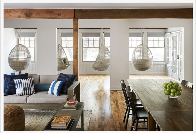
The common room at TNH in Grand Beach, Michigan.

well equipped for short and longterm stays (i.e. kitchens, laundry, etc.). The Neighborhood Hotel transforms old buildings with compelling history into well outfitted apartment style hotels that honor the old while representing the now. The vibe is fresh and fun with rooms that are stocked to support everyone from the homebody to the adventurer. The hotels provide a basecamp for the explorer and a sanctuary for travelers who need to recharge, reset or chill. The suites are simple and clean, punctuated with accents that bring the right amount of pop. The Neighborhood Hotel has locations in Chicago: Lincoln Park, Little Italy, West Loop (2025 opening) and Southwest Michigan: New Buffalo and Grand Beach.