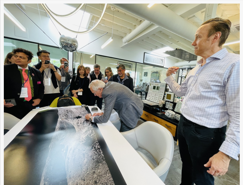
Astronaut Charles Duke signs the lunar landscape where the Apollo 16 landed at the Steve Jurvetson Space Museum in Los Altos