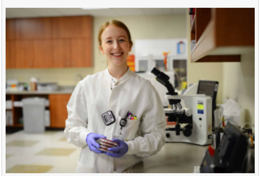
Students can explore careers like Medical Laboratory Scientist at SKHealthcareCareers.org