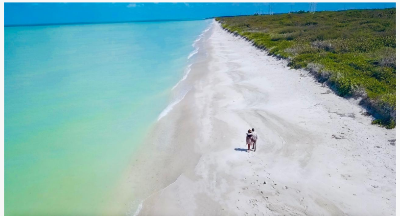
Playa Mundo Maya beach rivaling even the most renowned destinations like Tulum