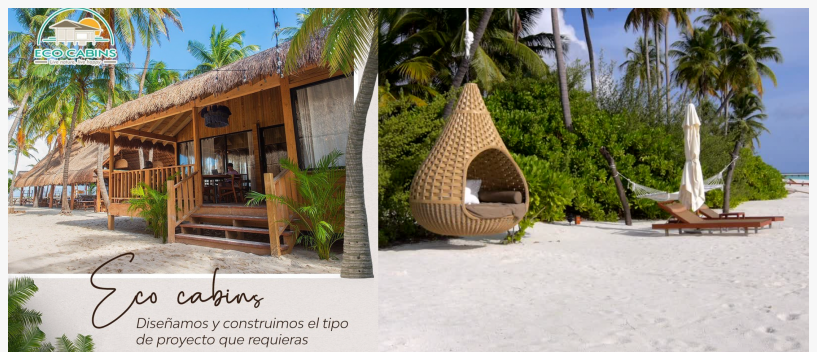
Eco-Cabins in Isla Aguada beach