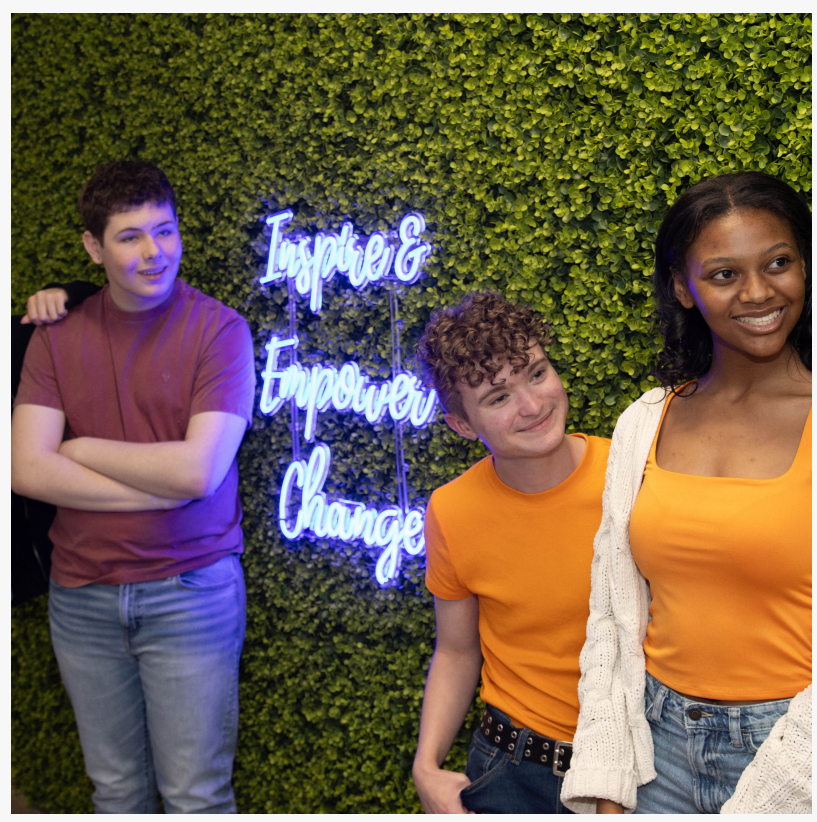
Teens and young adults in front of the Sandstone Care motto