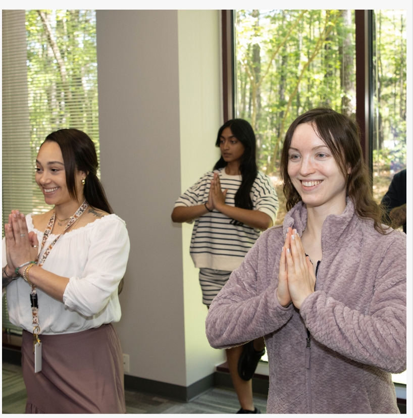
Teens and young adults doing a mindfulness activity

Addressing Substance Use Challenges in the Community