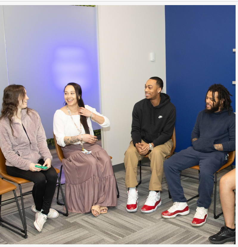
Young adults in a group therapy session

- Borderline Personality Disorder: Entails emotional instability, impulsive actions, and intense, often unstable relationships.