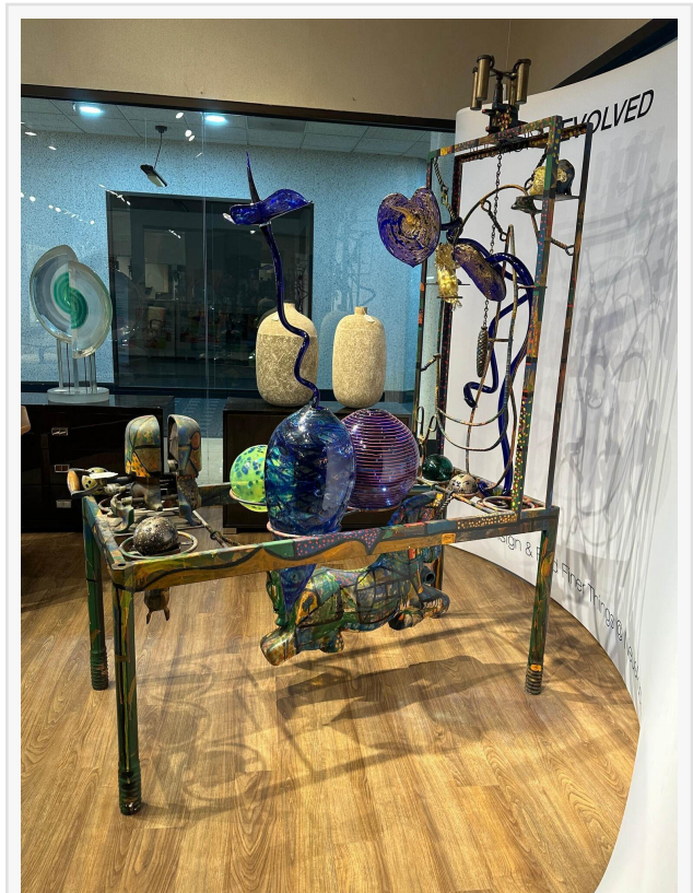
Mixed media glass construction collaboration between Dale Chihuly (American, b. 1941) and Italo Scanga (Italian/American, 1932-2001), titled Pinball Machine ($11,685).

Next up for Neue Auctions is an online-only auction slated for Saturday, June 29th. The deadline for consignments is Thursday, May 30th. Neue Auctions invites everyone to be added to its email list to receive notices and info regarding current and future sales. The firm is always seeking