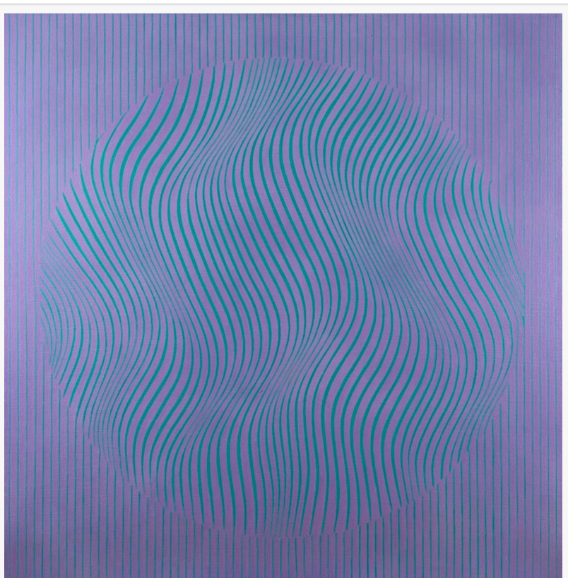
Early acrylic on canvas painting by Polish-born American artist Julian Stanczak (1928-2017), an untitled work done in 1965, hand-done, before the use of tape ($27,675).

Chihuly and Scanga were very close friends and were commissioned to make this piece for the