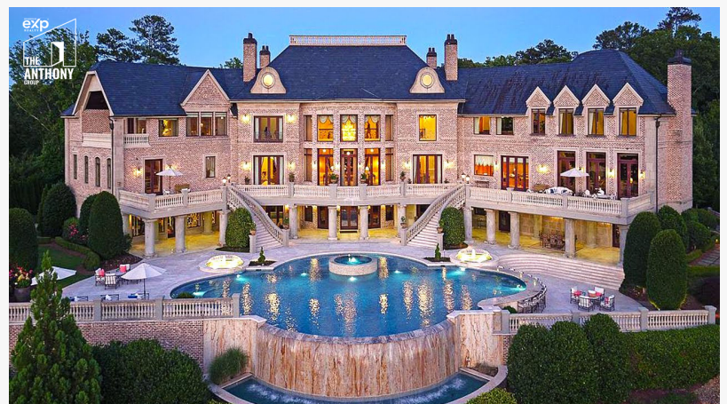
Atlanta Luxury Homes