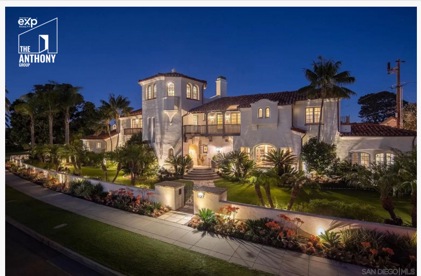
California Luxury Homes

The Anthony Group Showcases Client Testimonials