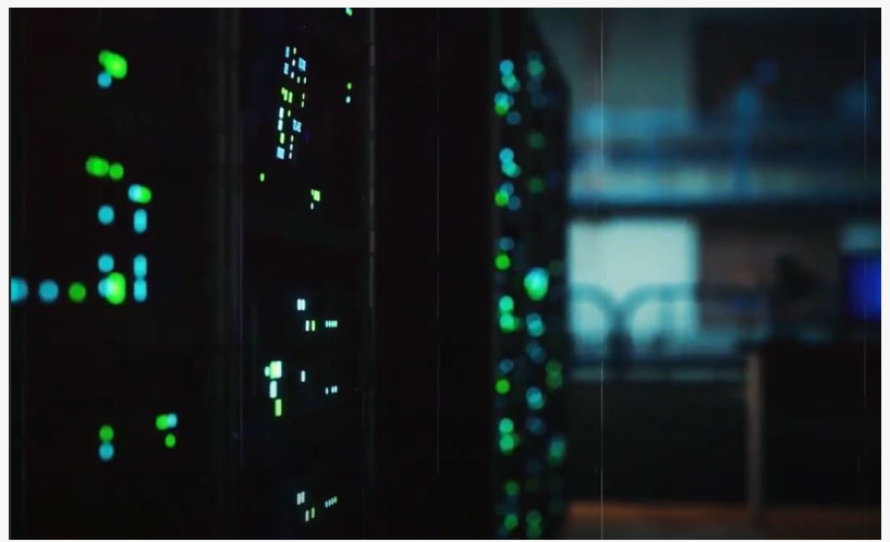
Houston Managed IT Services

“We seek first to understand, then onboard in a way that stabilizes the environment and reduces IT risks, the number of issues that occur, and their severity. We regularly assess and quantify your IT environment against industry best practices, scoring up to 322 different indicators. One of our dedicated account managers will work with you to build a plan that fits your business situation and closes gaps. And, along the way, we will regularly measure and report on progress against the plan while proactively managing your entire IT infrastructure so that you don’t have to.”