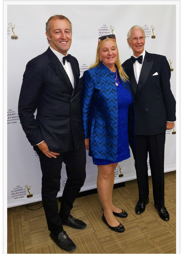
Prince Mario-Max Schaumburg-Lippe, Princess Antonia and Prince Waldemar Schaumburg-Lippe

This press release can be viewed online at: https://www.einpresswire.com/article/709626435