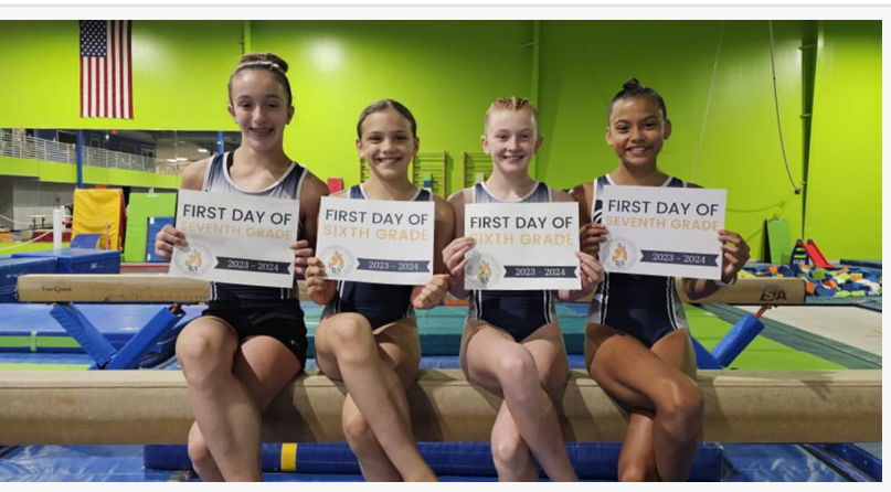
ILA Student Gymnasts on the First Day of School

"At IAA, we focus on equipping students with the essential academic and life skills necessary to successfully