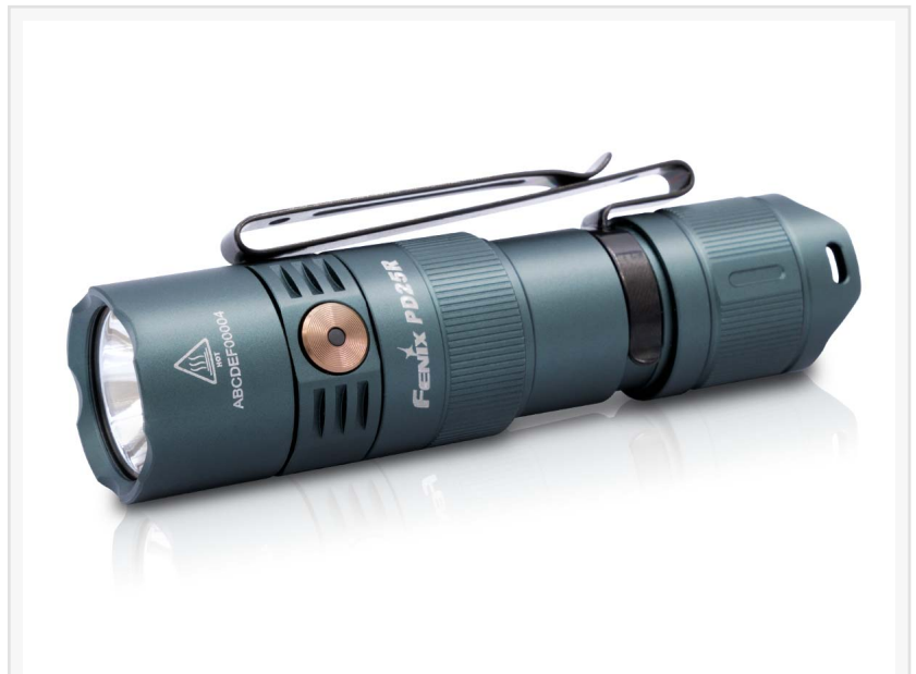
PD25R Sierra Green

Featuring a two-position body clip, the PD25R can be securely attached to a pocket or a pack for everyday carry. Its IP68 rating makes it dust and waterproof, providing reliable performance in all environments.