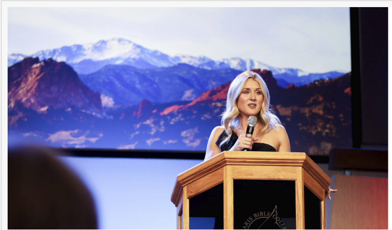
Guest Speaker Riley Gaines.

WOODLAND PARK, COLORADO, UNITED STATES, May 8, 2024 /EINPresswire.com/ -- Truth & Liberty Coalition (T&L), Inc., a non-profit based in Woodland Park, Colorado, recently held its second annual awards banquet fundraiser on the campus of Charis Bible College, located at 800 Gospel Truth Way in Woodland Park.