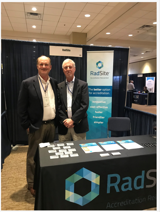
RadSite promoting its quality-based mission

To learn more about RadSite, visit <u>www.radsitequality.com</u>. To learn more about RadSite's complimentary webinars, <u>click here</u>.