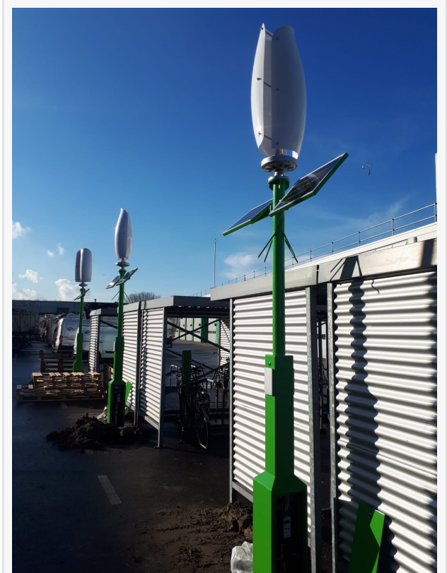
Wind and Solar E-bike Charging Poles