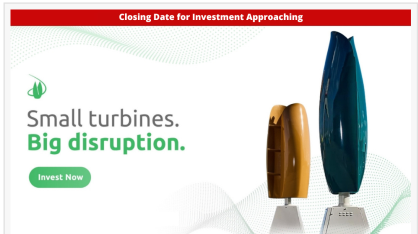
Closing Date for Flower Turbines Round

The turbines are also beautiful, quiet, and bird friendly. They start at lower speeds than other turbines and endure higher speeds. Their 30+ patents are loaded with aerodynamic, engineering, and electronic advances.