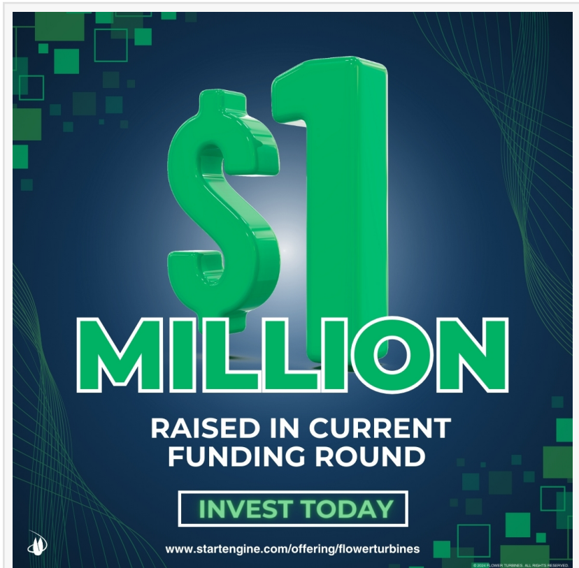
Flower Turbines Current Round Passes $1 Million

One of the disruptive innovations in the Flower Turbines business plan is to change the market for small wind turbines from one at a time sales to large project sales. As an example, 4 turbines correctly arranged perform as well as 8 turbines separately. This has a tremendous potential effect on the cost of wind energy in urban and suburban commercial and residential projects, or anywhere else where space is limited. The significance is like the difference between being able to put only one solar panel per roof versus many. And Flower Turbines does one better: its turbines make their neighbors perform better. This is an important scientific and business-model innovation.