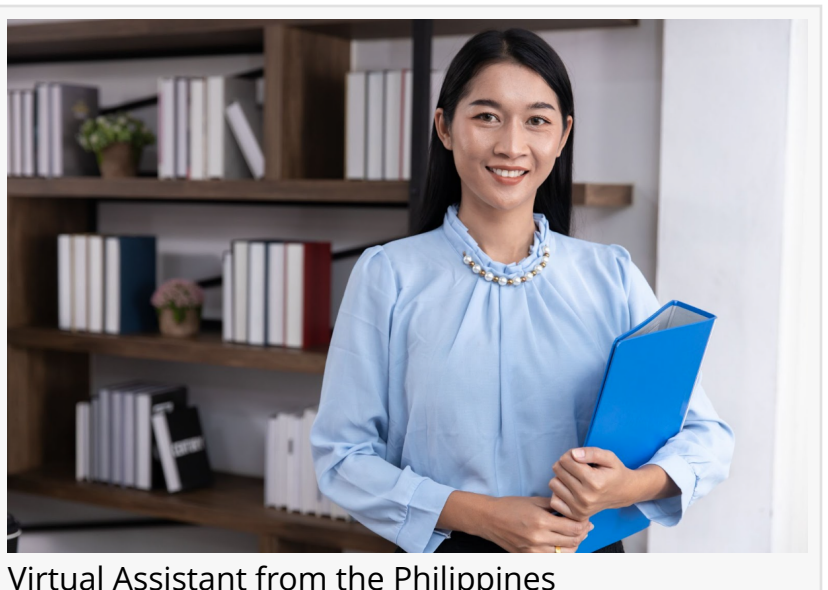
Virtual Assistant from the Philippines

in the company's ongoing mission to redefine traditional notions of work. With remote work becoming increasingly prevalent, Remote Raven remains at the forefront, driving innovation and fostering collaboration in the engineering sector and beyond.