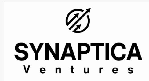
Synaptica Ventures Logo