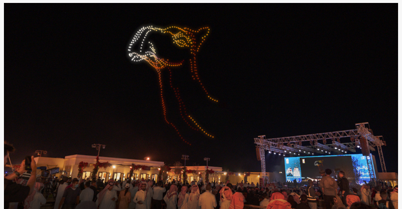
Cyberdrone's Show for The Camel Avenue Festival in Tabuk, Saudi Arabia

Cyberdrone is a high-tech drone company specializing in drone show technology and implementing it across different industries, transforming typical entertaining events and marketing performances into something new and extraordinary. The company has earned gold specifically in the New Event Technology category for The Camel Avenue Festival Drone Show in Tabuk, Saudi Arabia.