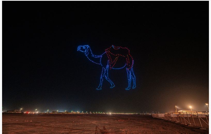
The Camel Avenue Festival Drone Show in Tabuk, Saudi Arabia