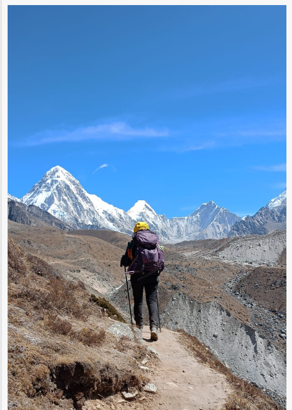
Everest base Camp trek

This Everest Base Camp trek is a must-do experience for adventure seekers and nature lovers, . It is a chance to push oneself to new limits, immerse in a different culture, and witness the awe-inspiring beauty of the Himalayas. With experienced guides and support staff, trekkers can embark on this journey with confidence and make memories that will last a lifetime. So, get ready for the adventure of a lifetime at Everest Base Camp.