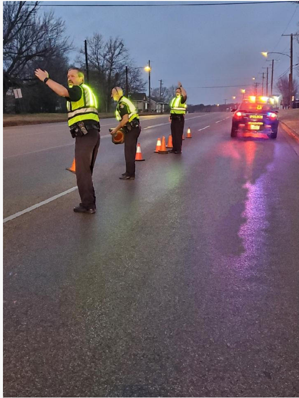
The light of the squad car does not disturb the green glow of the Lit LED vest.

The donor turned out to be Brown's mother.