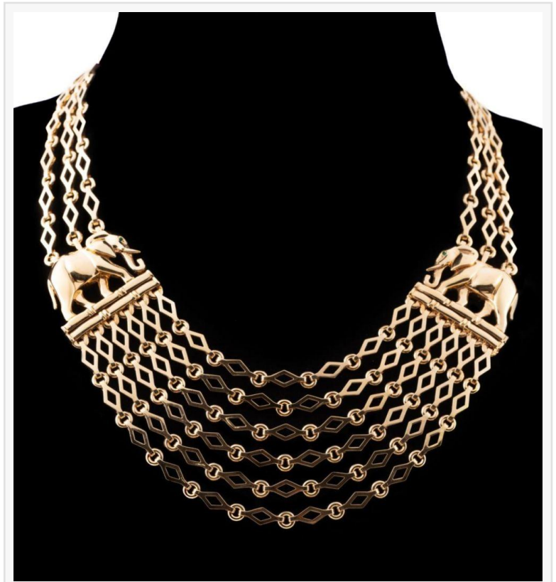
Circa 1980 Cartier 18k yellow gold multi-row elephant motif necklace, with triple upper rows, double elephant stations with emerald eyes, and a six row lower bridge ($14,520).

Natalie Ahlers Ahlers & Ogletree, Inc. +1 404-869-2478 email us here