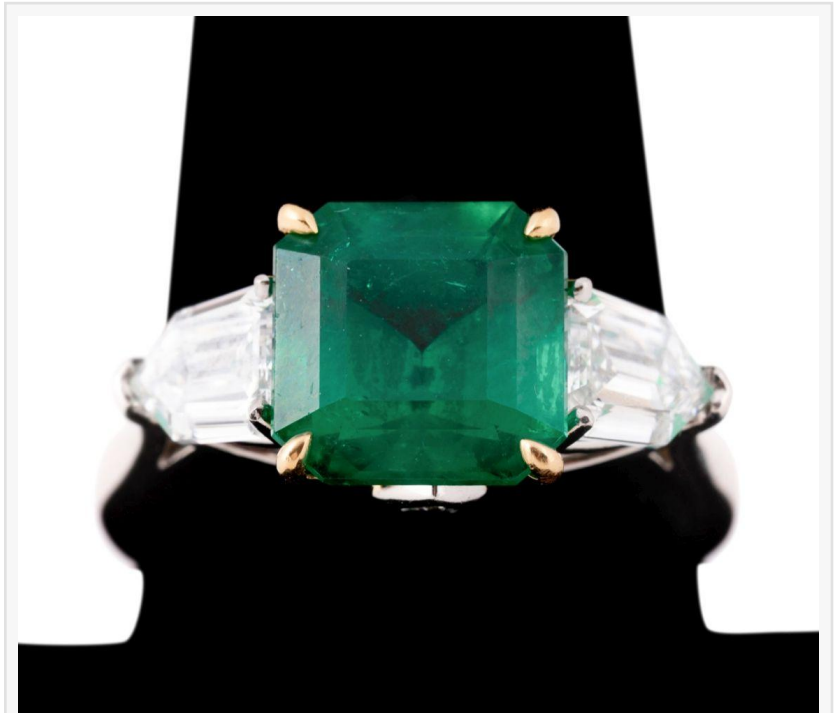
Richard Krementz. emerald and diamond ring in platinum and 18k yellow gold, with a square shaped green emerald weighing 4.44 total carats, set in between accent diamonds ($30,250).

The 2021 Rolex Oyster Perpetual Cosmograph Daytona 'Paul Newman' 38mm watch in 18k yellow gold featured a Swiss-made perpetual movement, three subsidiary dials, an oyster bracelet with flip lock clasp and synthetic sapphire crystal. The watch was marked 'Rolex' to the dial and came with inner and outer boxes, manuals, a green movement tag and a COA card. It sold within the estimate.