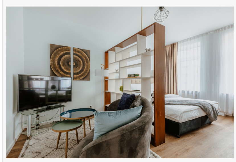
Fully-equipped and key turn ready