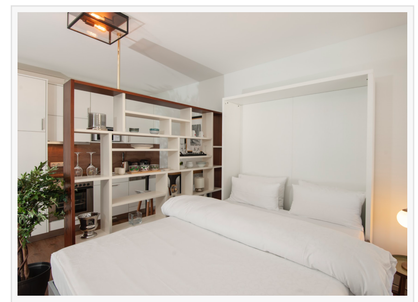
Everything is included to make this a home away from home for mid to long stays!

Aimed at redefining living and working amenities for business travellers, KING's apartments combines the