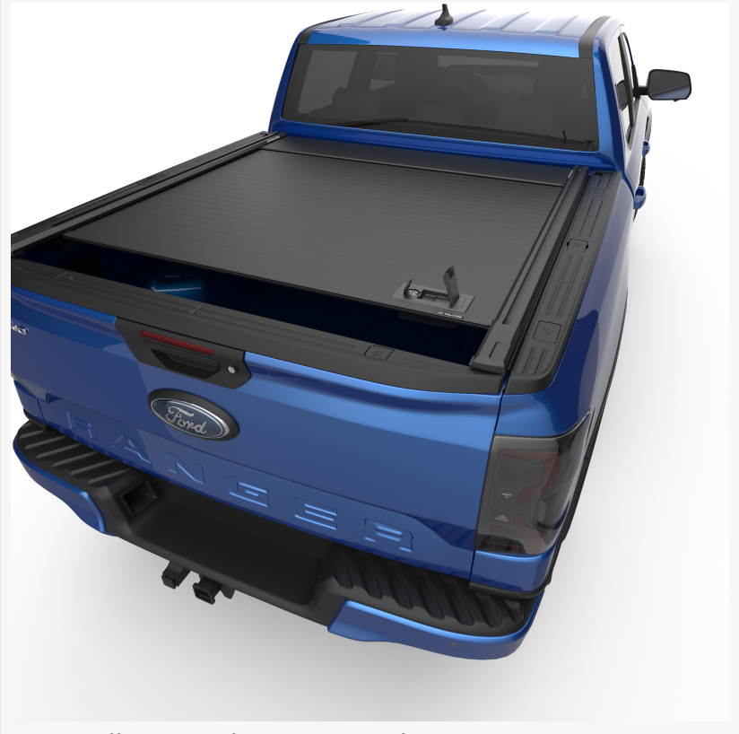
EGR RollTrac Bed Cover - Ford Ranger

The automotive division distributes globally to top branded OEMs EGR manufactures with a focus on vertical integration to ensure timely response and avoid supply chain disruptions. In