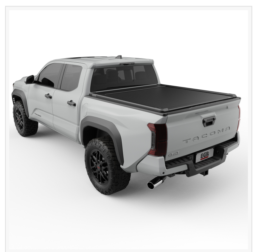
EGR RollTrac Bed Cover - Toyota Tacoma