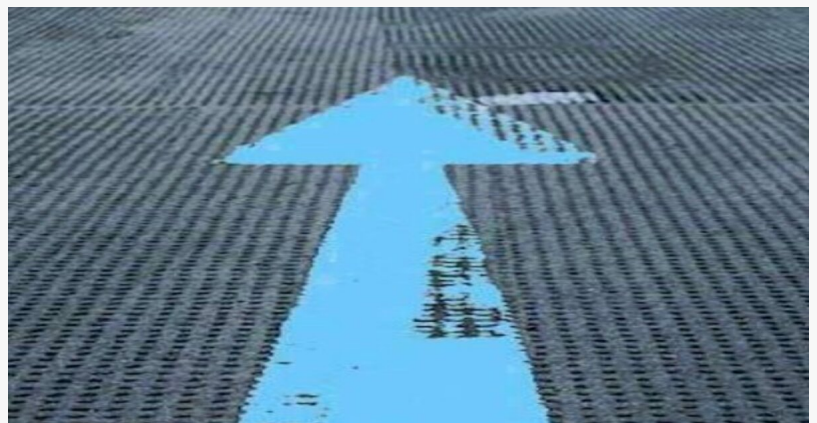
Logo arrow shows the path forward.