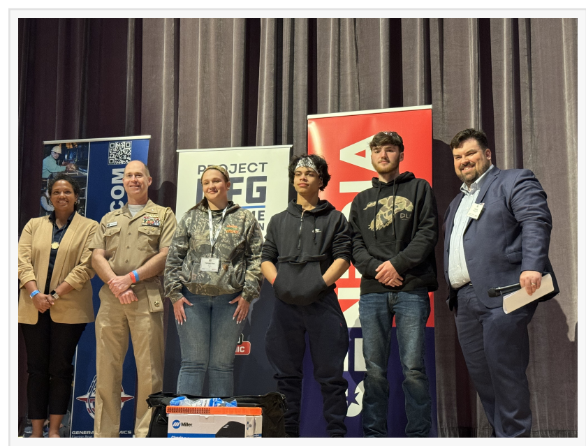
Winners of the May 6th Maritime Welding Competition

"A strong national defense demands a strong workforce, and Rhode Island continues to play a critical role in