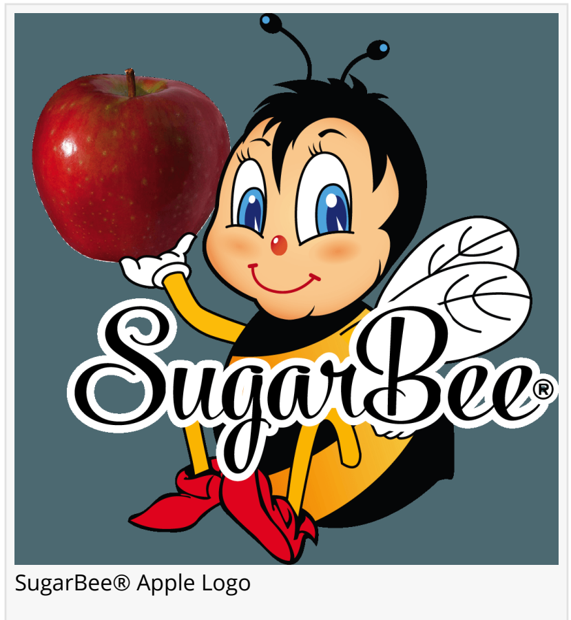
SugarBee® Apple Logo