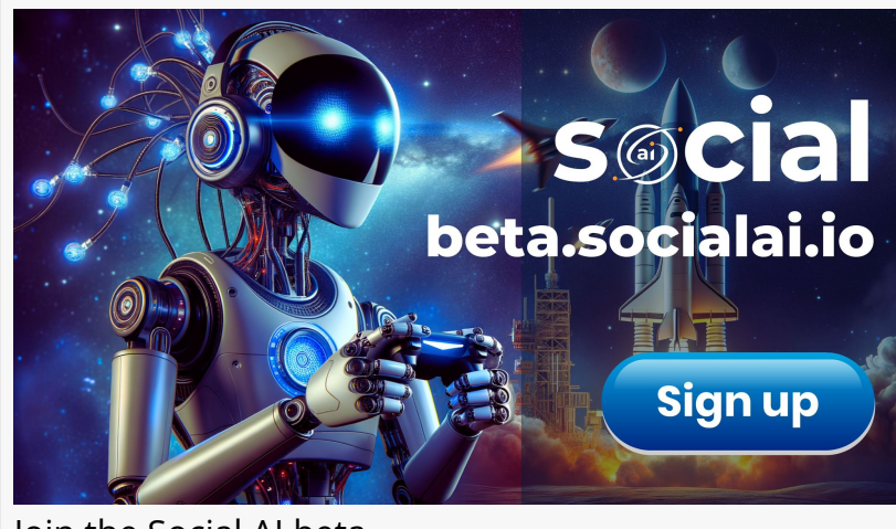
Join the Social AI beta

SocialAl.io stands as a pioneering platform that translates social media data into actionable insights, leveraging advanced analytics and Al