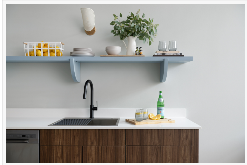
Little Italy: Each suite is thoughtfully designed with a kitchen and everything you need for a short, or long stay.

"Our apartment-style hotel suites fit well into the Homes & Villas by Marriott Bonvoy's luxury portfolio and