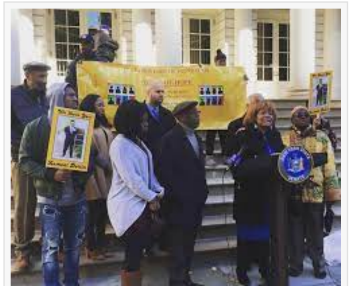
Passing of NY Senate Bill S6437A