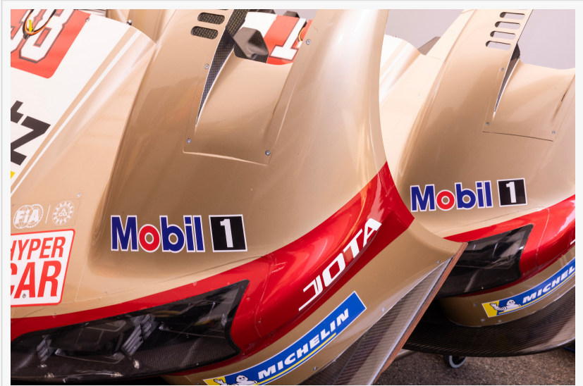
Mobil 1 with Hertz Team JOTA_2

For 50 years, Mobil 1 has been trusted by drivers to keep their engines running longer. Our products combine the latest technology and innovation to exceed the toughest standards of vehicle manufacturers and tuning shops—so consumers can get the most out of their time behind the wheel, both on the road and on the track. Turn every day into an adventure with Mobil 1, the world's leading synthetic motor oil brand. Learn more at www.mobil.co.uk or follow