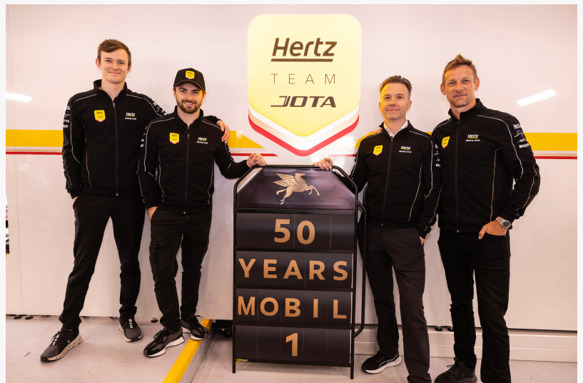
Mobil 1 with Hertz Team JOTA_1