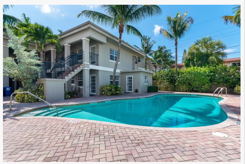
Seaside Palm Beach Premier Addiction Treatment Center Pool Facility

the first step in your or your loved one's addiction recovery. Please reach out today at 561-220-3908 or visit the Seaside Palm Beach website for more information.