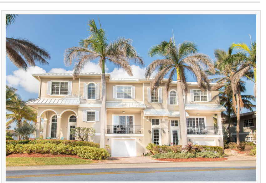
Seaside Palm Beach Premier Addiction Treatment Center Facility