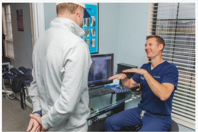
Spine & Disc Specialists Exam and Consultation