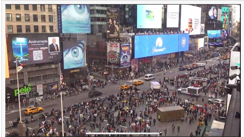
Andromeda on Times Square, New York

TIMES SQUARE, NEW YORK, US, May 9, 2024 /EINPresswire.com/ -- In a literary tour de force that captivates the imagination, Charles Carroll Lee's latest science fiction masterpiece, Andromeda , was showcased on Times Square. This visual celebration marks the book as a significant contribution to the genre, drawing the attention of thousands in one of the world's most electrifying venues.