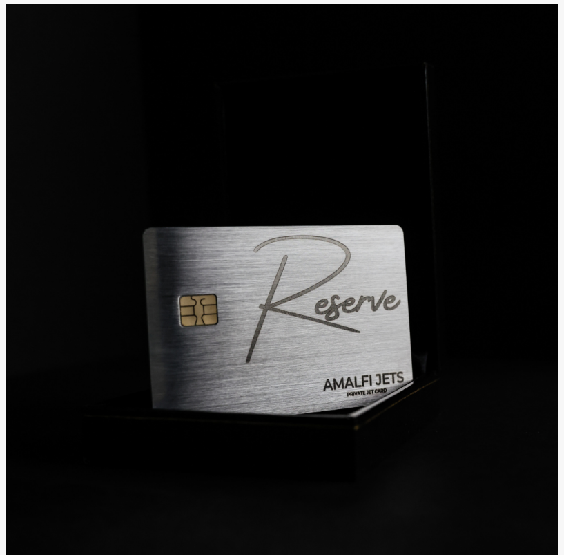
Amalfi Reserve Membership

To take advantage of this offer, interested travelers must download the Amalfi App and subscribe to the Membership in May.