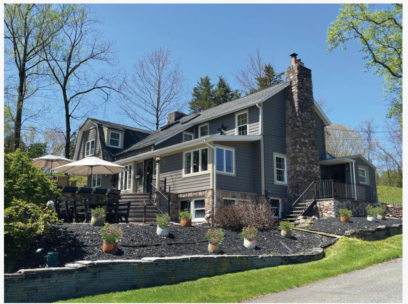
3 Bedroom Country Home

Prospective buyers are invited to attend the property previews on Wednesday, May 22nd, and Saturday, June 1st, from 12-2 PM. This is an excellent opportunity to explore the property firsthand and envision the possibilities it holds. To access the Property Information Package and online bidding instructions, please visit www.maxspann.com . Bidders can participate in the auction through their computers or by using the Max Spann phone app.