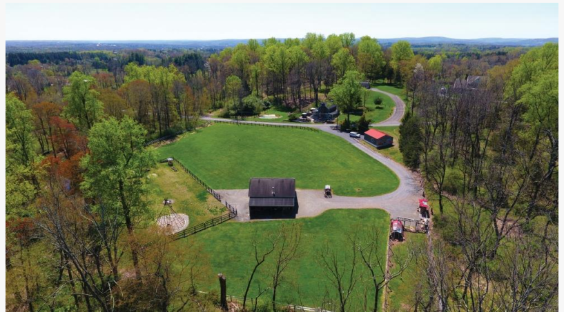
Alexandria Township, NJ