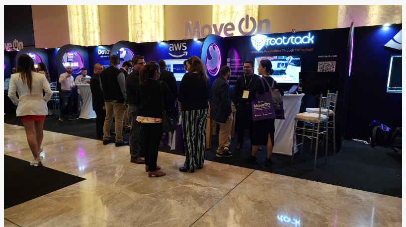
Rootstack at MoveOn 2024

Talks and presentations on artificial intelligence, the use of technology in the health industry, Fintech and cybersecurity were among the most interesting at the event, which is very useful for the Rootstack team since it is focused on these areas to enhance the projects the company is