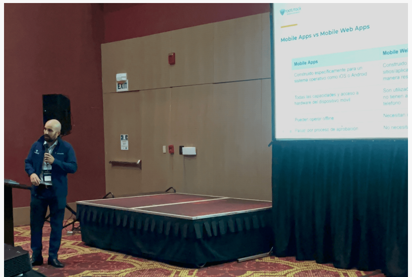
CTO Diego Tejera at MoveOn 2024