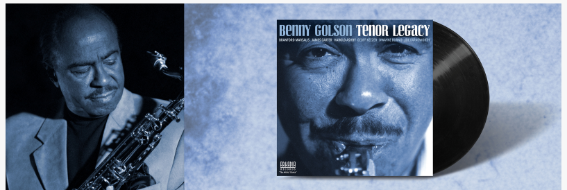
Benny Golson: Tenor Legacy