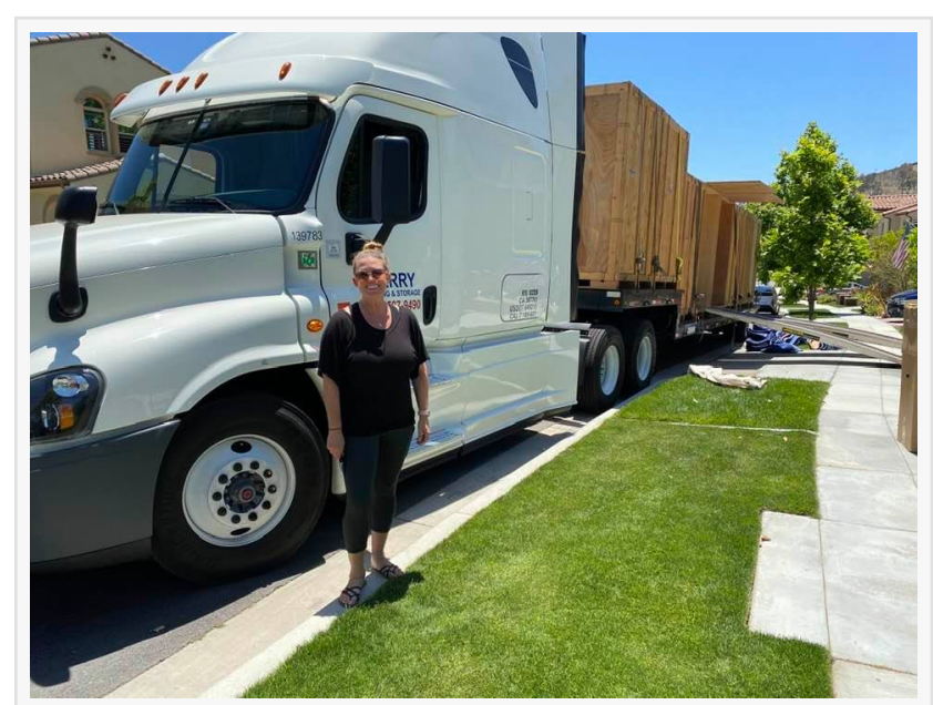
Safe, convenient, secure storage for short- or longterm rental

LAKE FOREST, CA, UNITED STATES, May 13, 2024 /EINPresswire.com/ -- As summer approaches and the moving season gears up, individuals in and around Orange County, including surrounding cities like Corona and Chino Hills, are preparing for relocations that need temporary or long-term storage. The industry leaders at <a href="Terry Moving & Storage">Terry Moving & Storage</a> break down the available options, sharing which are suitable for different circumstances.