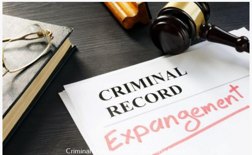
Daytona Beach Criminal Defense Lawyer