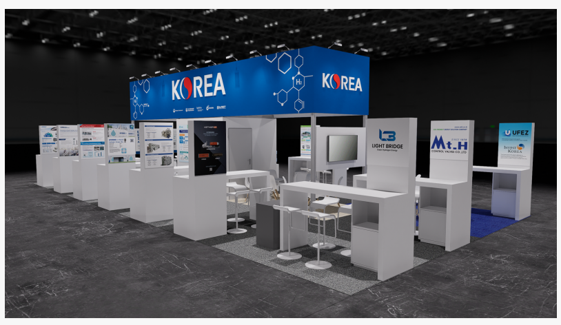
Preview of Korea Pavilion at WHS 2024

Korean hydrogen-related businesses and organizations.