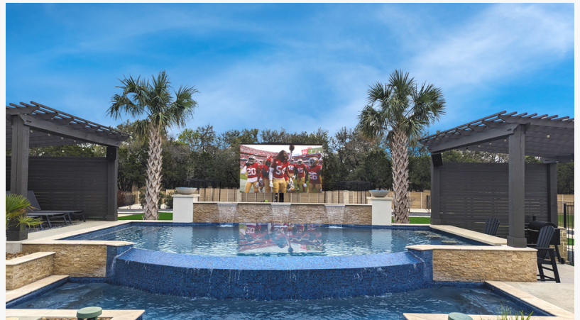
The Rise 158 Inch TV

DALLAS, TEXAS, USA, May 13, 2024 /EINPresswire.com/ -- YOLO TV, the renowned leader in large format outdoor televisions, proudly announces the launch of its groundbreaking innovation: YOLO TV Rise.