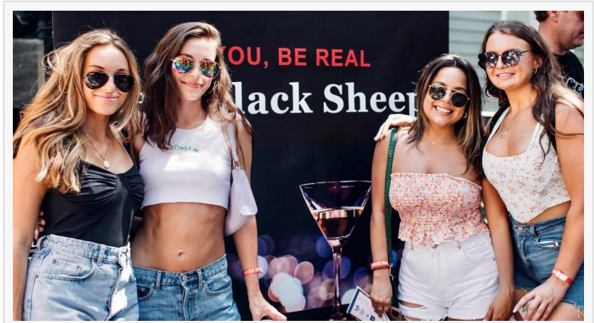
Black Sheep Tequila celebration with supports ready to toast to Black Sheep's Triple Still Award win.

Black Sheep's best-in-world distinctive taste and aromatic profile are due to the additive free handcrafted and organic process, which provides a new meaning to the premium category. Reshaping the palate and perspective from party shots to an enjoyable affluent beverage of choice, this black sheep goes against the grain, providing education, better ingredients, and a superior product.