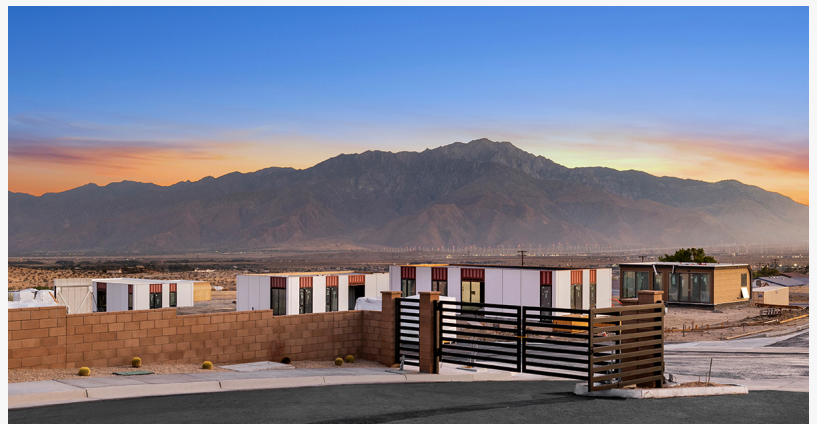
Scenic Crest Villas, Desert Hot Springs, Near Palm Springs, California