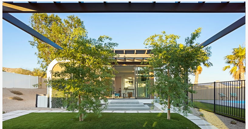
Scenic Crest Villas, Desert Hot Springs, Near Palm Springs, California