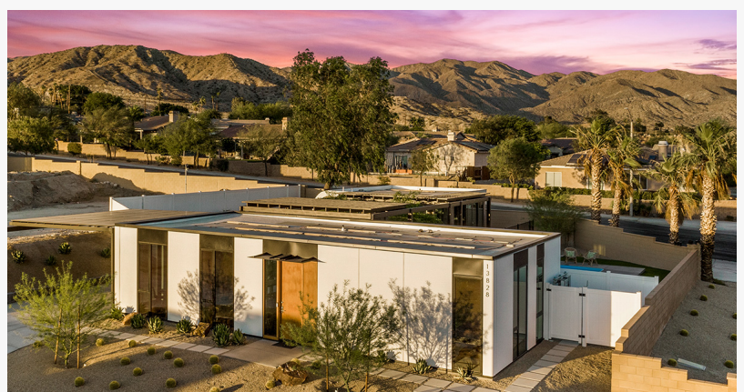
Scenic Crest Villas, Desert Hot Springs, Near Palm Springs, California