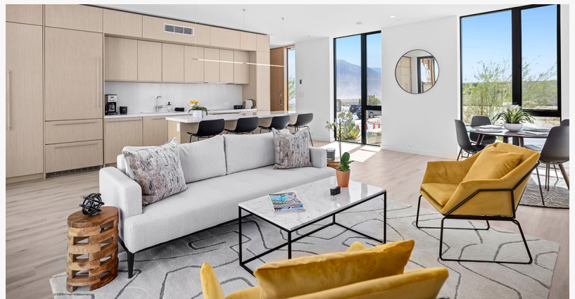
Scenic Crest Villas, Desert Hot Springs, Near Palm Springs, California

"For the world's most unique properties, Concierge Auctions is the best in the business. As the first-of-its-kind 3D-printed community ever, I felt this exceptional property is best served by