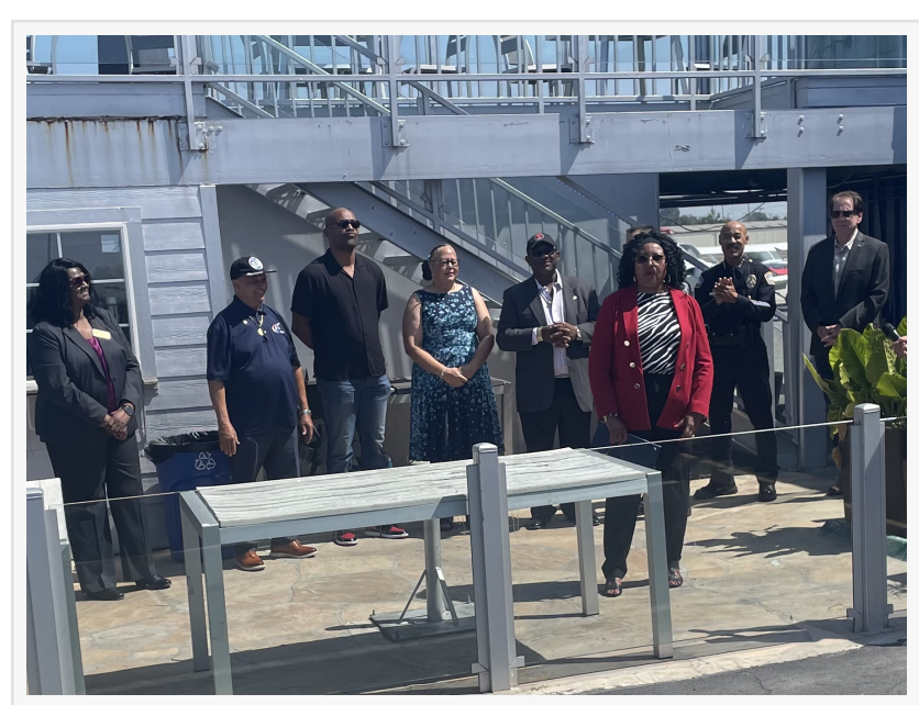
Happy 100 Year Birthday

COMPTON, CALIFORNIA, USA, May 13, 2024 /EINPresswire.com/ -- 961 Alondra Blvd. Compton, CA 90220 Saturday, May 11, 2024 was a Big Birthday Party. Compton Celebrated a Century of Flight at the ComptonWoodley Airport in the City of Compton Yes, 100 Years. T.A.M. <u>Tuskegee</u> Aeronautical Museum joined the City of Compton, County of Los Angeles in Celebrating 100 Years of Flight. The City