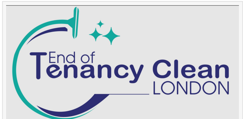
End Of Tenancy Clean London

Move-In Cleaning: Detailed cleaning that prepares a new home for arrival, creating a welcoming