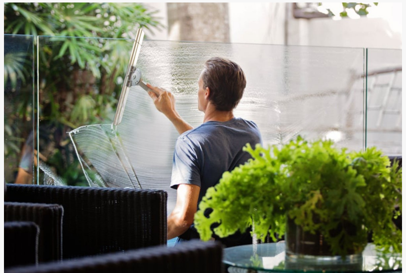
Professional Cleaners in London