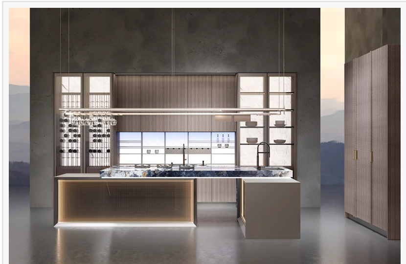
oppein custom kitchen cabinets