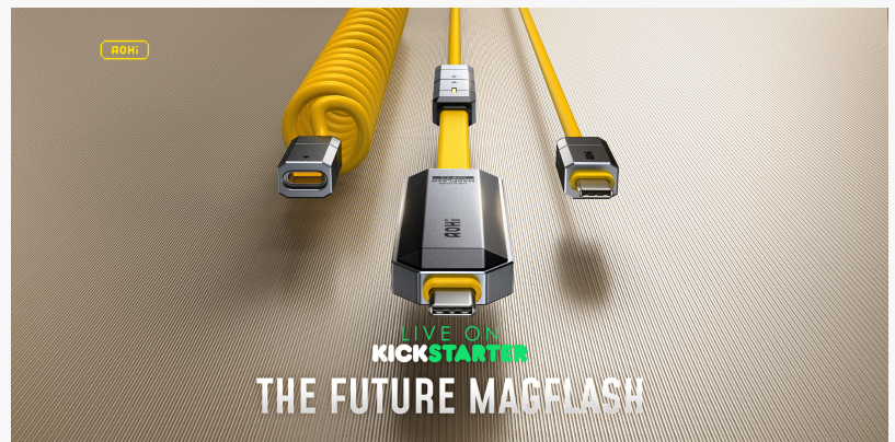
AOHi MagFlash 02