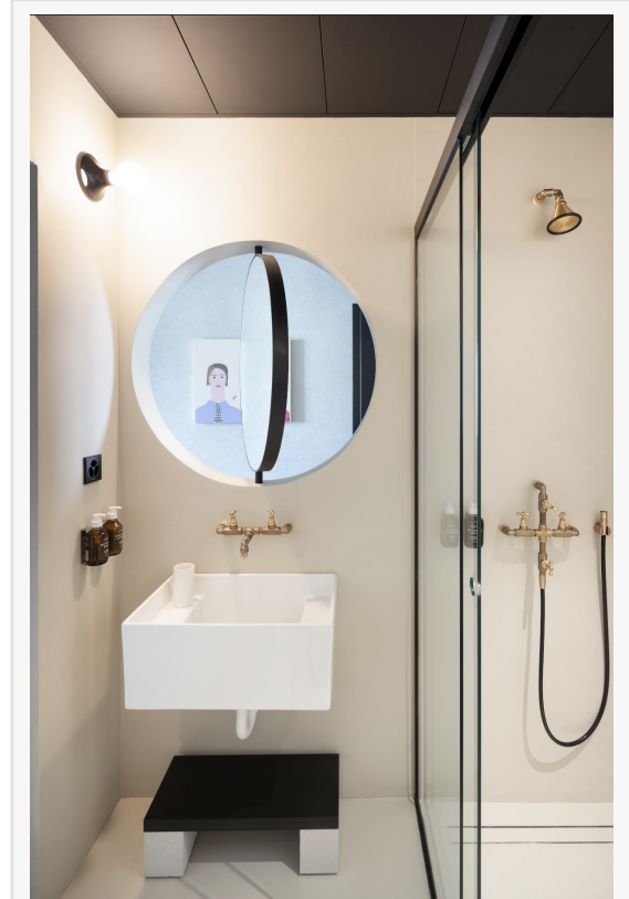
B5 Boutique Hotel Lugano Nomad Bathroom