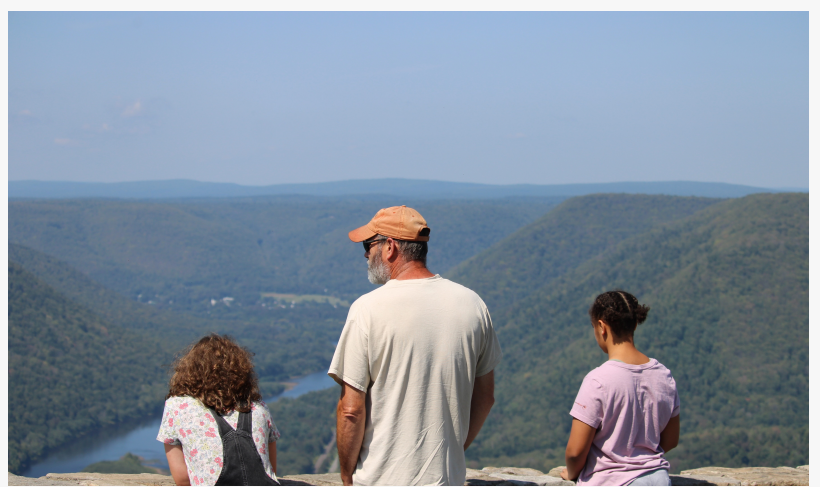
Visitors enjoy the view at Hyner View State Park

Share your state park experiences using #ILoveMyStateParksWeek on social media and follow NASPF, PPF, and DCNR for event updates. NASPF provides resources like a social media toolkit and daily theme toolkits at NASPF Website.