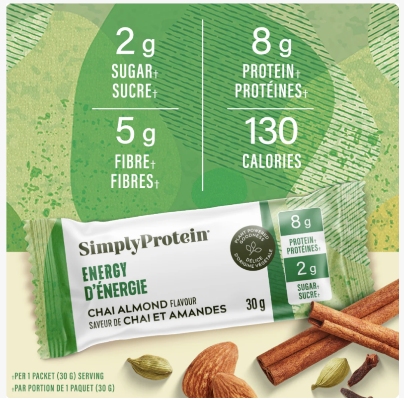
SimplyProtein Energy Bites in Chai Almond